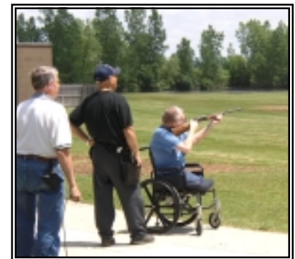
Annual Family Field Day

Membership applications can be obtained online at the club website. Memberships are also sold at the club and are valid for 365 days from purchase date.