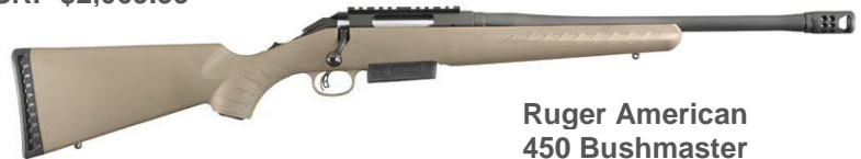
Ruger American 450 Bushmaster Item Number 16950 MSRP $599.00