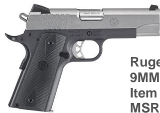
Ruger SR1911 9MM Luger Item Number 6722 MSRP $979.00