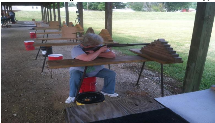
Traditional Table Shoot: This Is A National Competition.

Wanted: Volunteers to be trained as Range Officers WWSC is seeking Range Officers. Range Officers are needed for 4.5 to 5.5 hour shifts on Saturdays and Sundays.