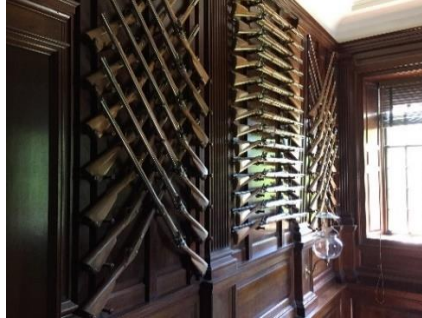
They are British Brown Bess muskets

Foyer at Governors mansion at Colonial Williamsburg..