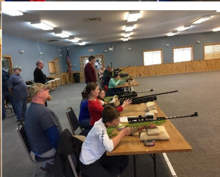
Airgun league photos