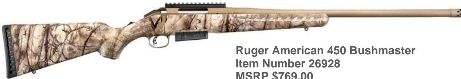
Ruger American 450 Bushmaster Item Number 26928 MSRP $769.00