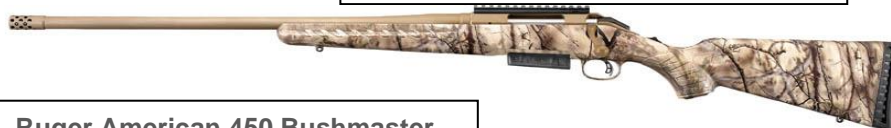
Ruger American 450 Bushmaster Item Number 26928 MSRP $769.00