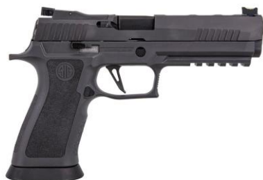
Sig Sauer P320 XFIVE Legion 9mm Luger Item Number 320X5-9-LEGION-R2 MSRP $1,099.99