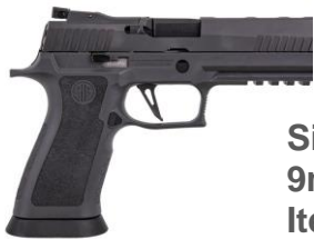
Sig Sauer P320 XFIVE Legion 9mm Luger Item Number 320X5-9-LEGION-R2 MSRP $1,099.99