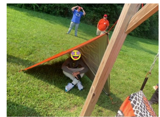
Photo of one of the makeshift shelters as part of a survival course.