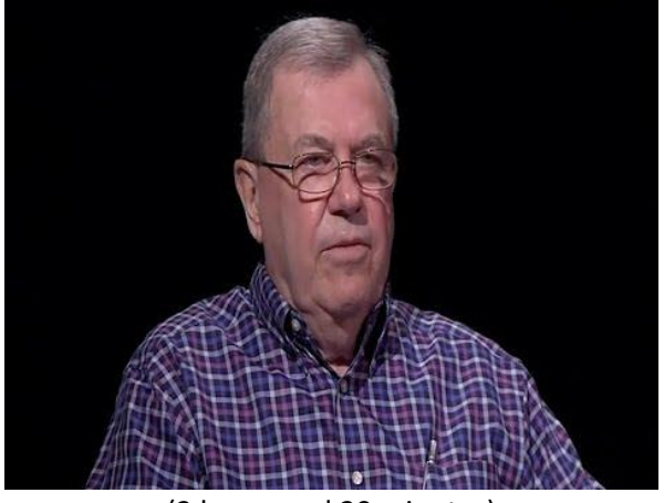
(2 hours and 20 minutes)