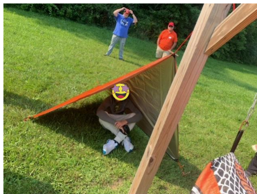
Photo of one of the makeshift shelters as part of a survival course.

Click the icon Support and Pray. For Our Troops