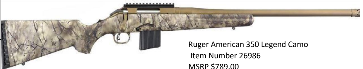
Ruger American 350 Legend Camo Item Number 26986 MSRP $789.00

Charter Meeting No charter meeting. Board Meeting November 28 th 7:00pm