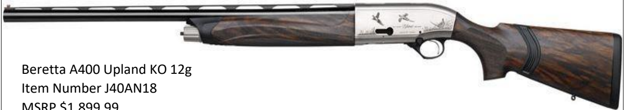
Beretta A400 Upland KO 12g Item Number J40AN18 MSRP $1,899.99