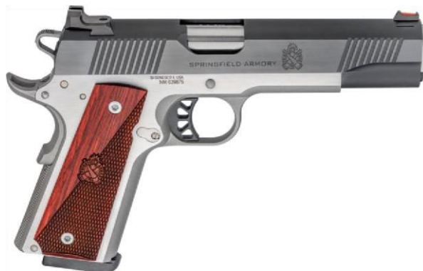
Springfield 1911 Ronin 9mm Item Number PX9119L MSRP $917.00

Ranges & Outdoor Archery Please call ahead (616) 453 - 5081 before coming out.