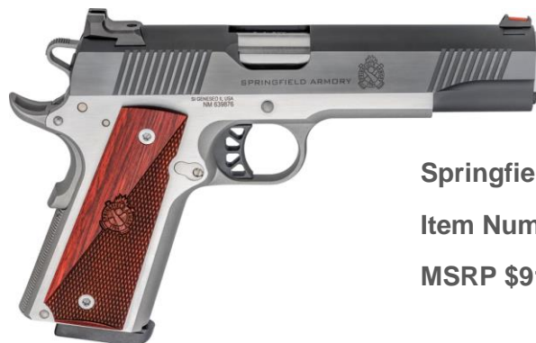
Springfield 1911 Ronin 9mm