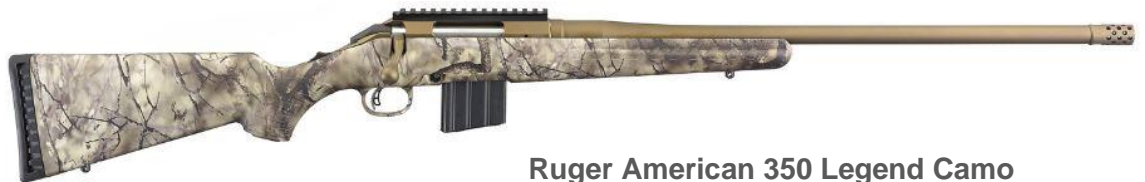
Ruger American 350 Legend Camo

Indoor Archery Skeet & Trap Wed 9a-12, 6p-10 Sat 10a-2p Sun 10a-2p