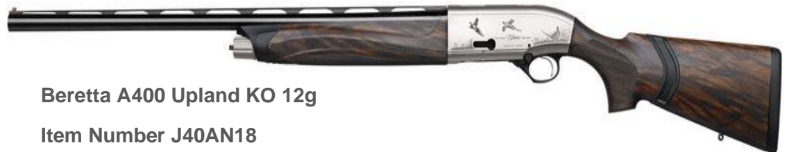
Beretta A400 Upland KO 12g

Charter Meeting December 14 th 7:30pm Board Meeting December 26 th 7:00pm