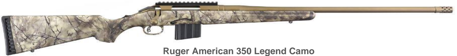
Ruger American 350 Legend Camo