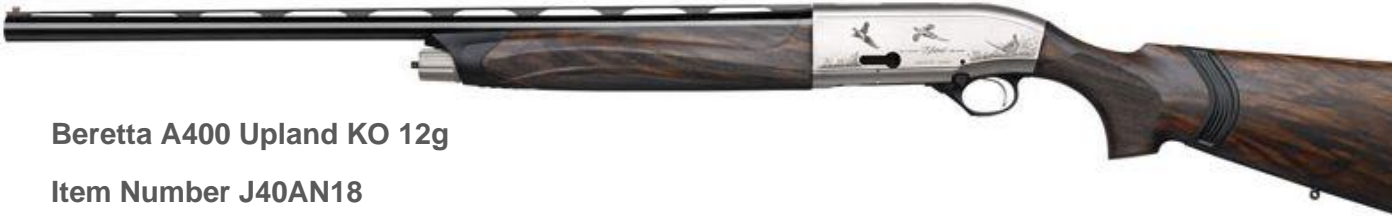
Beretta A400 Upland KO 12g