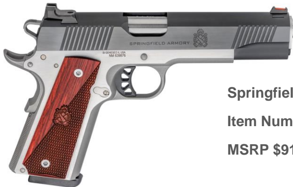
Springfield 1911 Ronin 9mm