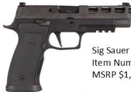
Sig Sauer P320 AXG Pro 9mm Item Number 320AXGF-9-BXR3-R2 MSRP $1,329.00