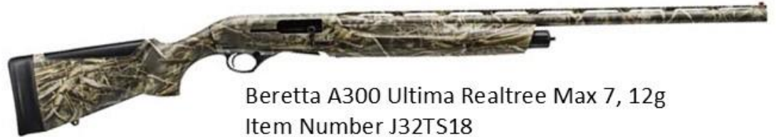
Beretta A300 Ultima Realtree Max 7, 12g Item Number J32TS18 MSRP $1,079.00