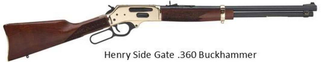
Henry Side Gate .360 Buckhammer Item Number H024-360BH MSRP $1,248.00