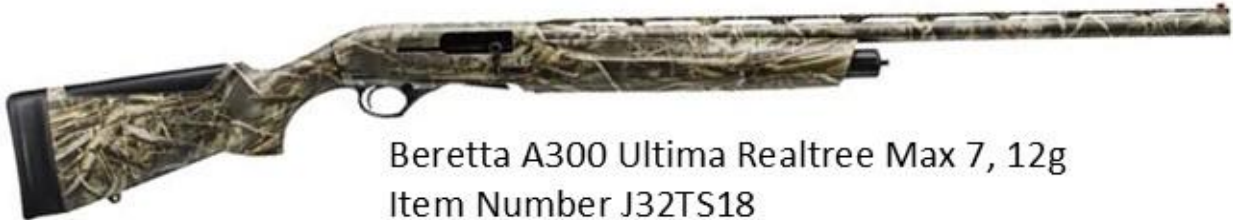
Beretta A300 Ultima Realtree Max 7, 12g Item Number J32TS18 MSRP $1,079.00