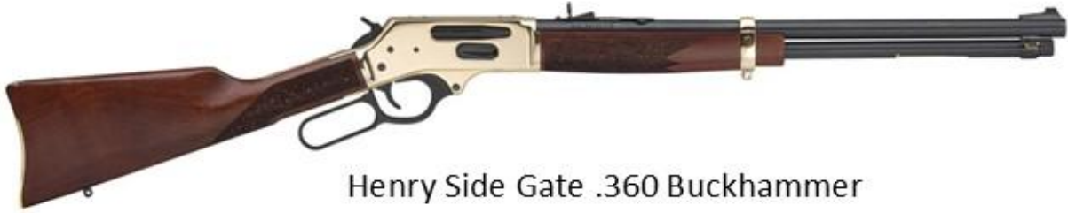
Henry Side Gate .360 Buckhammer Item Number H024-360BH MSRP $1,248.00