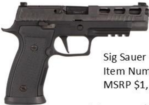
Sig Sauer P320 AXG Pro 9mm Item Number 320AXGF-9-BXR3-R2 MSRP $1,329.00